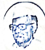
Kisan Mahadeo Veer Expenditure and Income

UDISE No. : 27311111516 Index No. : 121.11.001